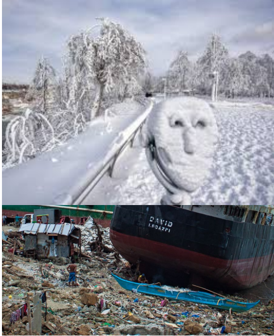
Typhoon Haiyan in the Philippines