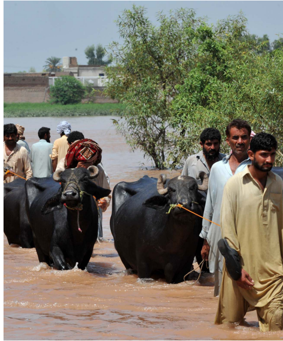
Floods in Pakistan