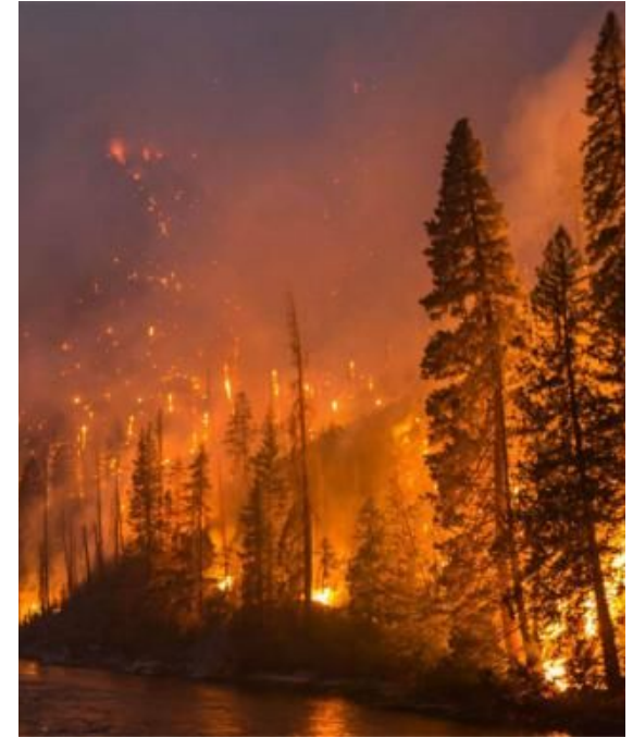
Wildfires in Washington